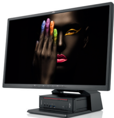
Mini PC with Universal Monitor Stand