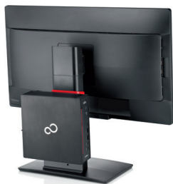
Mini PC powered from the display via Type-C option

With the mini PC and mini power pack, you gain a tidy desk and save space without compromising on computing power or security. Mounted discreetly on the display stand, the ESPRIMO eliminates cable clutter.