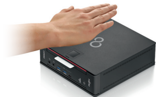
Mini PC with PalmSecure™ authentication

Powered by ESPRIMO Q mini PC and Intel Unite® solution, the ESPRIMO MRE (Meeting Room Edition) enables conference participants to share content easily and wirelessly by connecting to a shared screen.