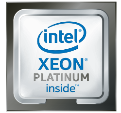
Intel® Xeon® Platinum processor

By choosing Fujitsu for your next data center modernization project, you will benefit from Fujitsu's globally available experience in deploying large-scale data center infrastructure and the longest track record in delivering integrated systems with first shipment back in 2002.